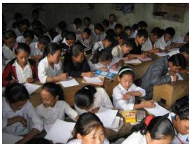
Class 6 (73 students) drawing

An art competition (classes 6 to 10) took place. Students were given the theme of 'My home' and drew pictures of their home, school and national symbols. Cards are to be made of some of the winning entries and pictures drawn at Garimudi Secondary School as a fund-raising idea. Some pictures are also being sent to a school in Arizona, London and Abu Dhabi where students have penfriends.